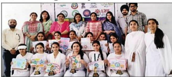
Students of GCW Udhampur posing for a group photograph on Tuesday.

The main aim and motive of conducting this activity was to create awareness and to generate some innovative ideas among the community on how to reduce the use of